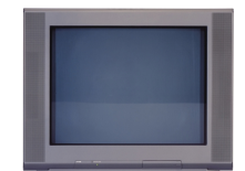
Standard Screen HDTV (4:3 Aspect Ratio)