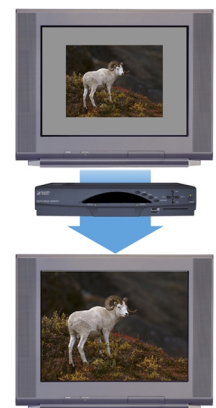
(480i or 480p fills the screen)